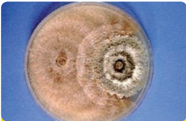
Gliocladium catenulatum J1446 in product development. G. catenulatum J1446 sporulating on Rhizoctonia solani in dual culture on PDA agar. (Verdera)