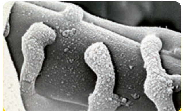
The hyphal interaction between Gliocladium catenulatum J1446 and Rhizoctonia solani in dual culture demonstrated by scanning electron microscope. Appressorium-like structures of G. catenulatum attach to a hypha of R. solani , which shows that hyperparasitism is involved. (Verdera)